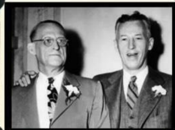
The two co-founders of Alcoholics Anonymous, Dr Bob, and Bill W. circa 1935

Big Book pg 180-181, "Doctor Bob's Nightmare"